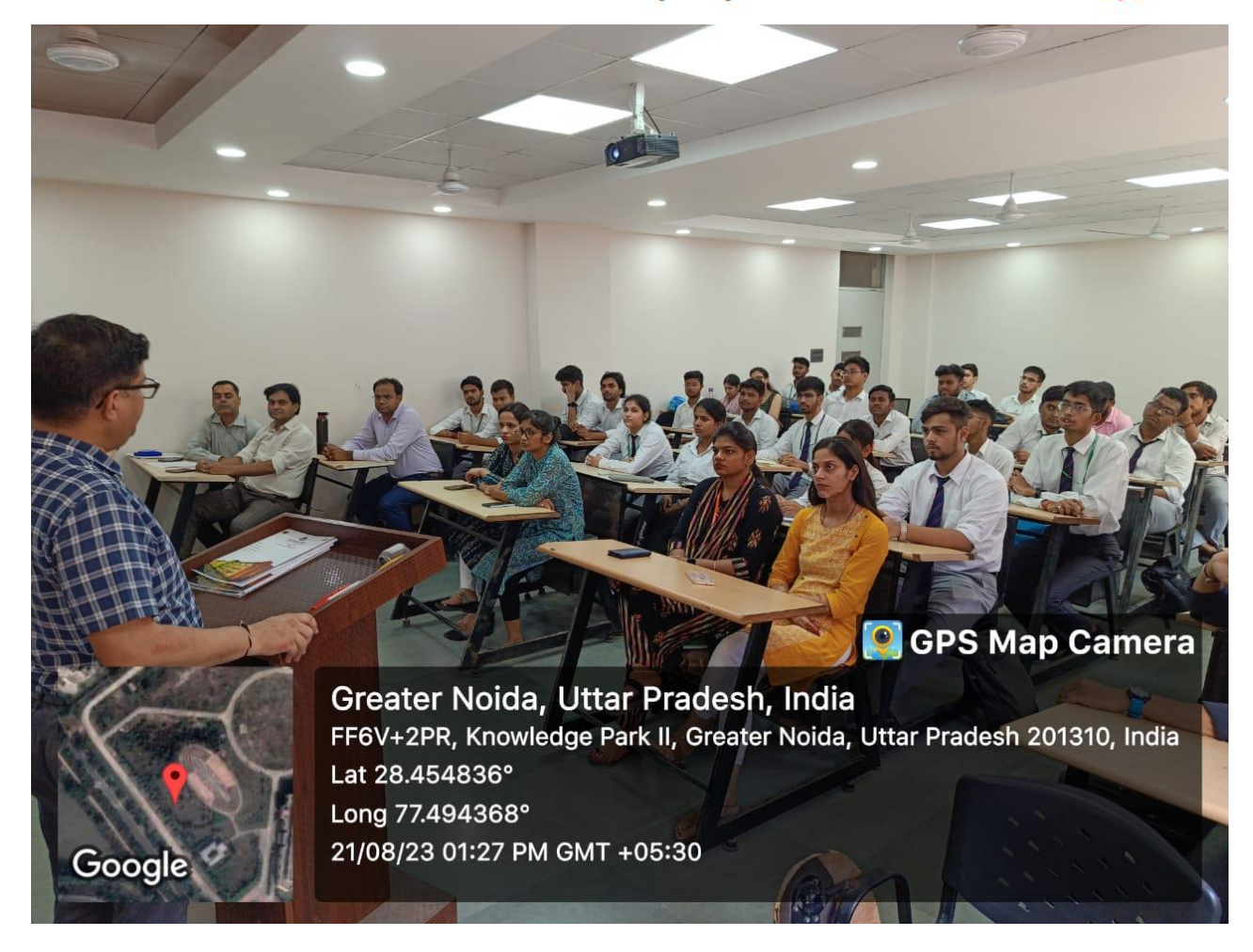
Figure 4 Students of BCA and Faculties during the celebration of World Entrepreneurs Day