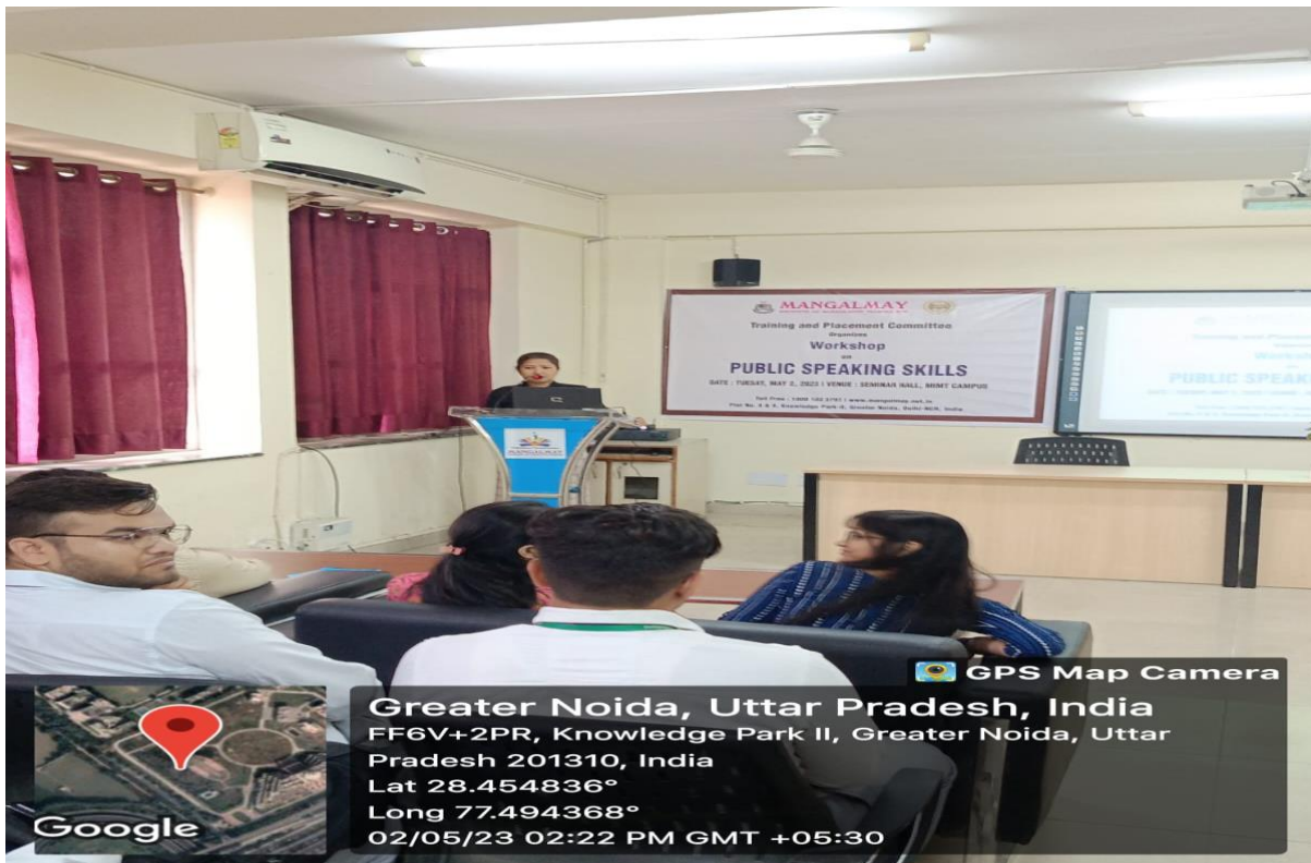
Pic-2: Address by the Guest Speaker