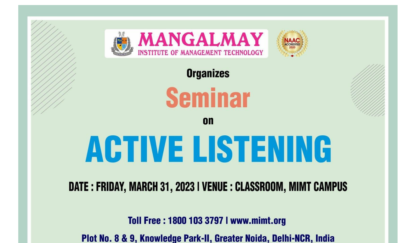
Figure 1 Flex of the Event