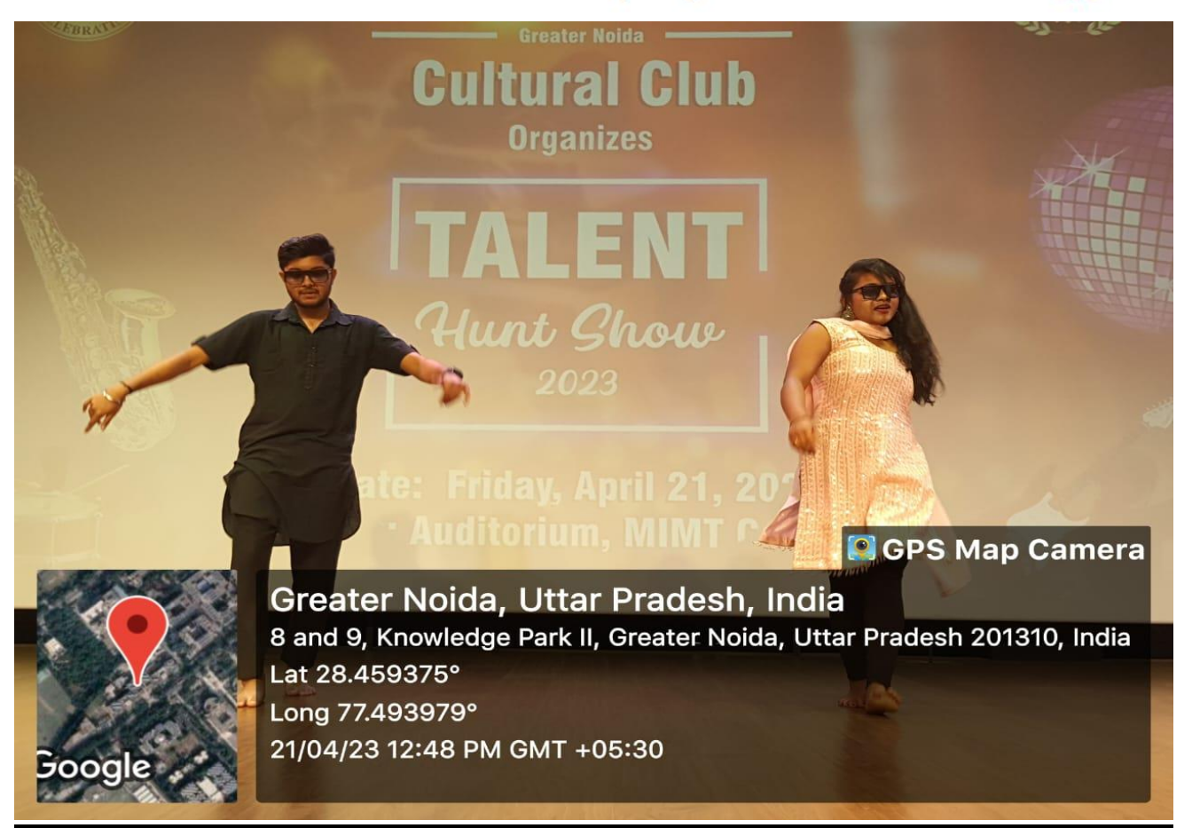
Figure 4: Students performing the dance.