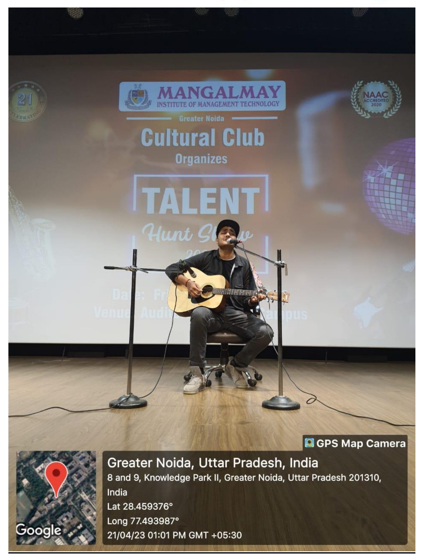
Figure 5: Student presenting his singing performance.