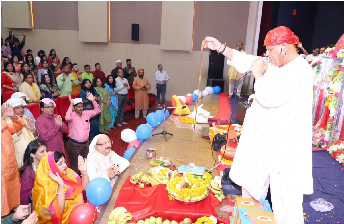
Panditji performing 'Jyot Prajwalan'