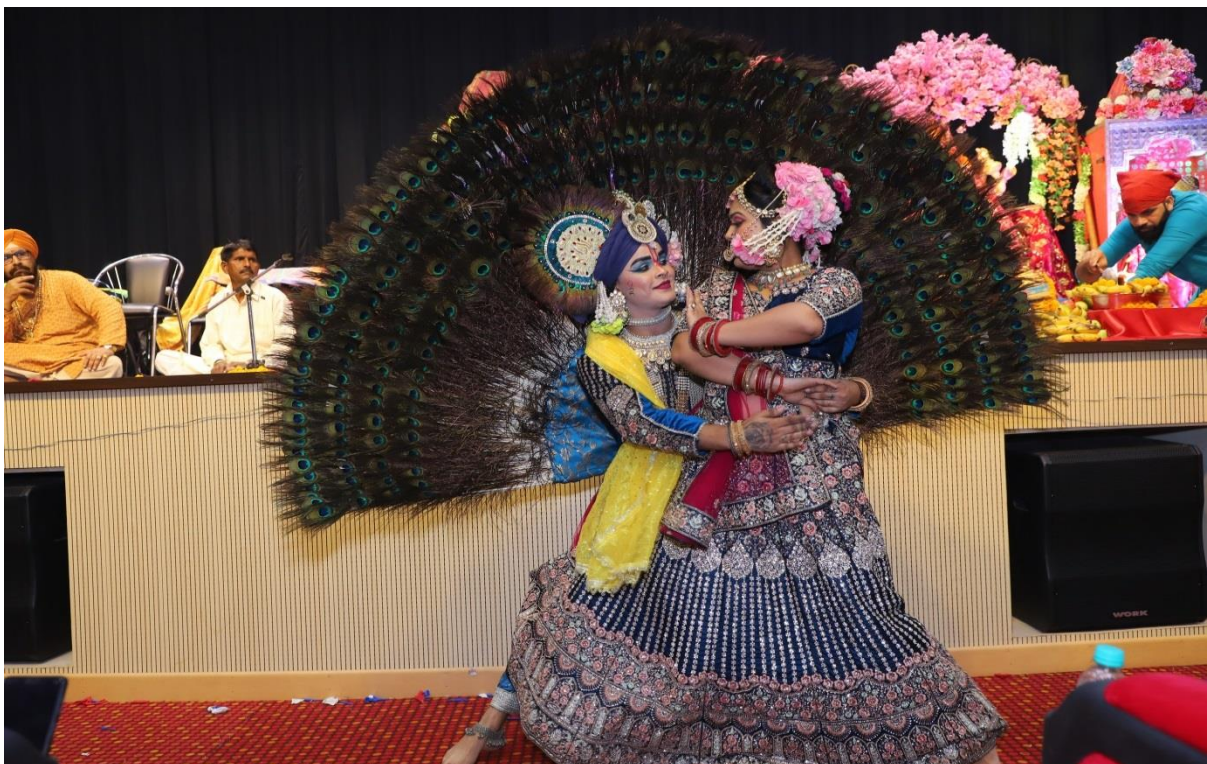
The ornately dressed Radha and Krishan in a still from there devout performance