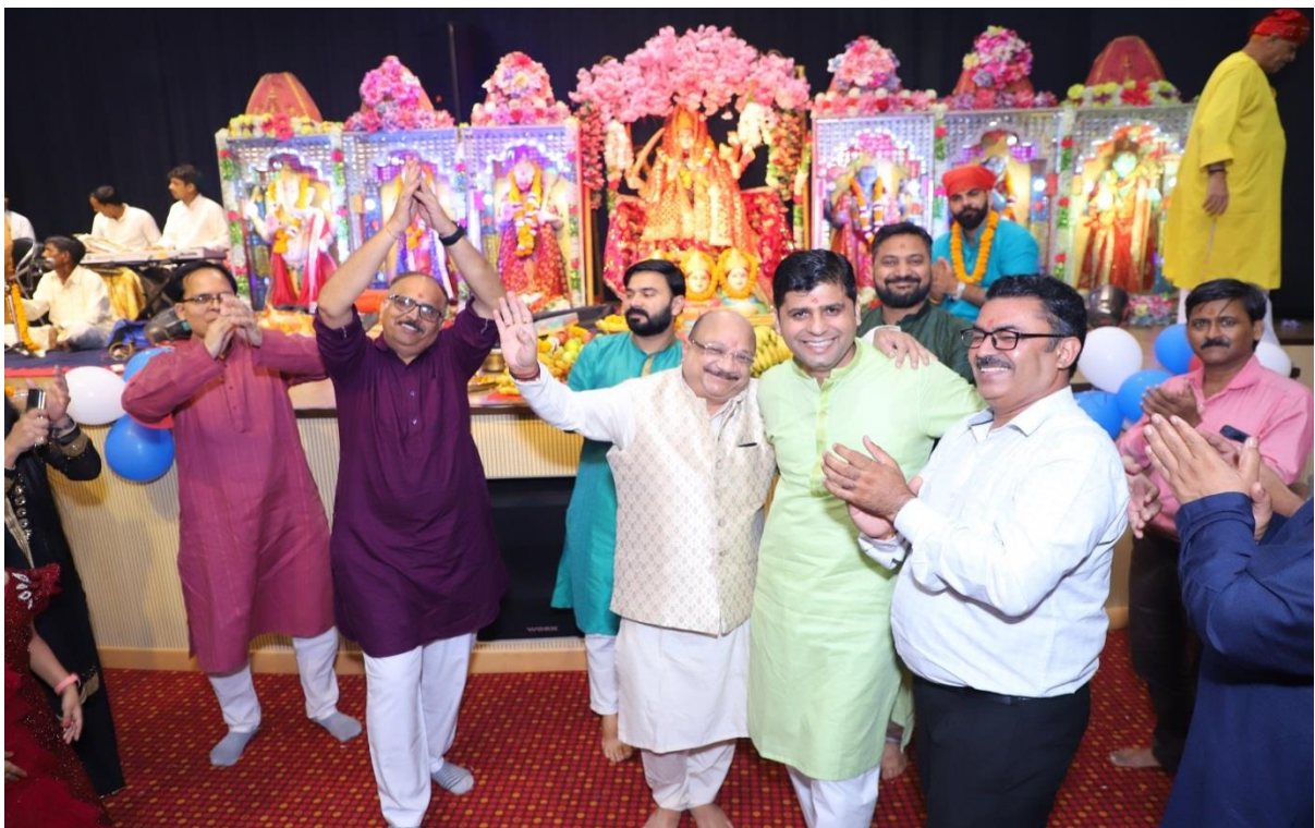
Mangalmay management immersed in the devotion for Maa Shakti