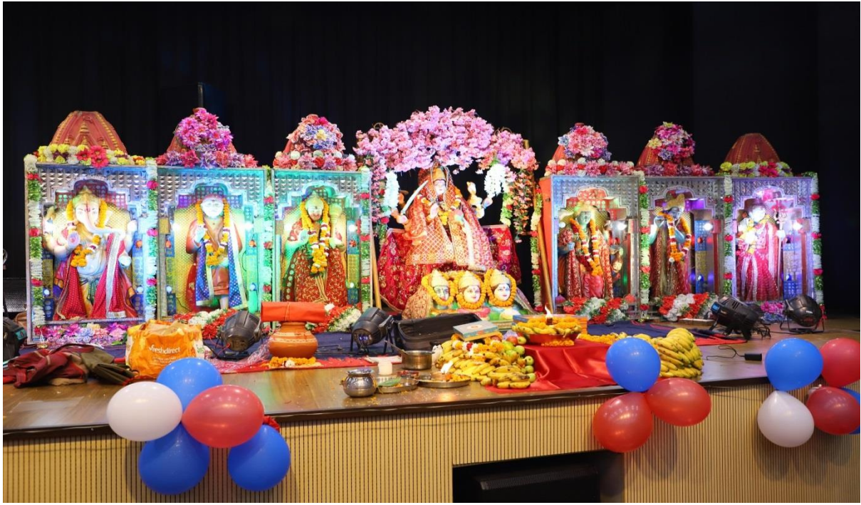
Floral decoration and sculpture of deities