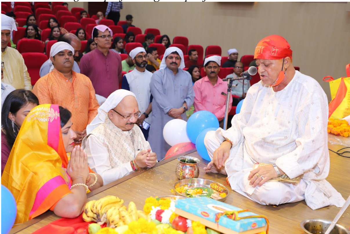
Mangalmay parivaar seeking Maa Shakti's blessings