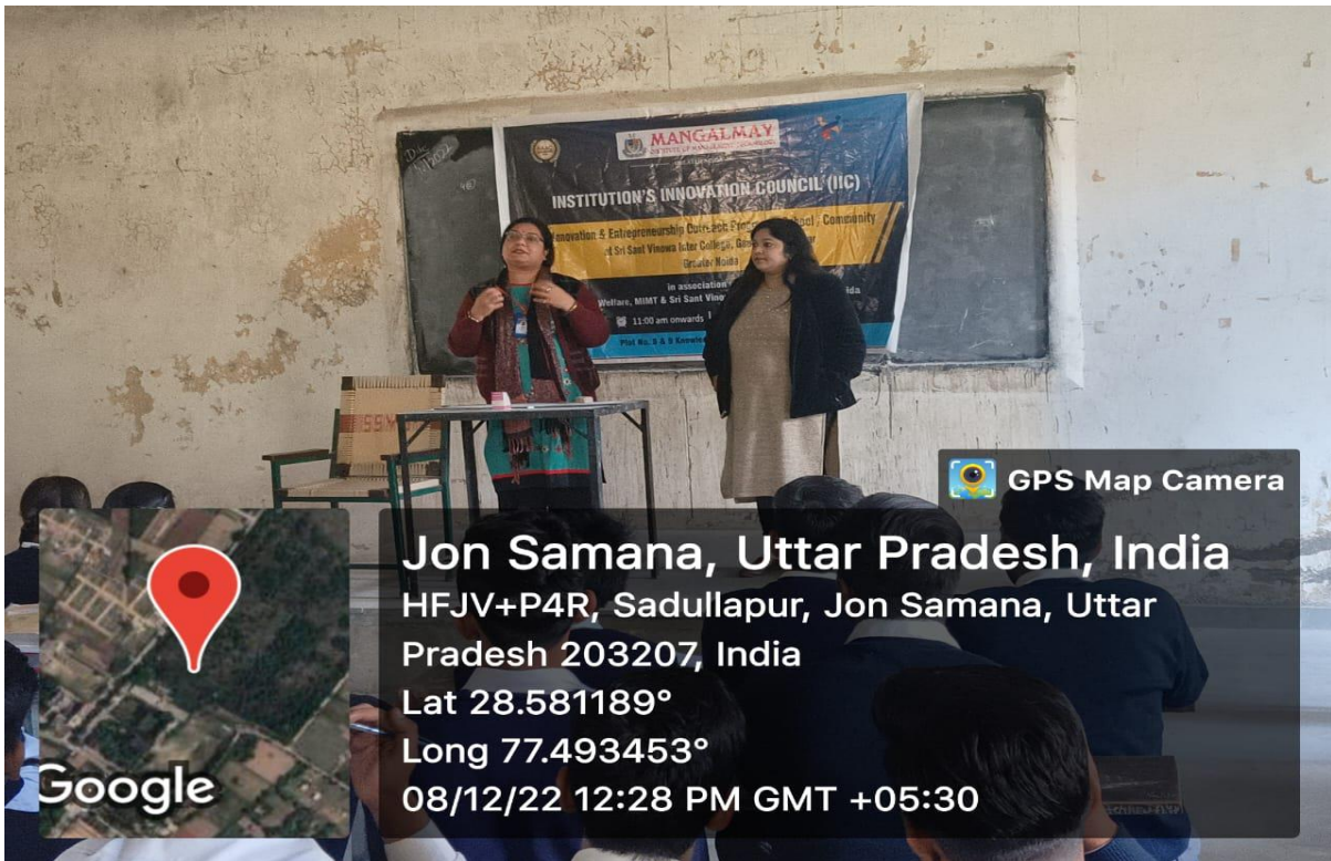
Figure 7 MIMT Faculties resolving school student's queries