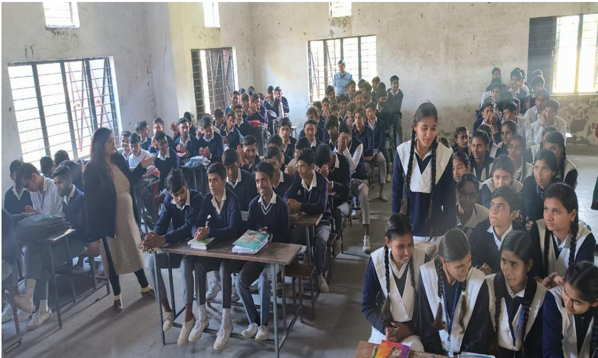
Figure 6: School students raising their queries