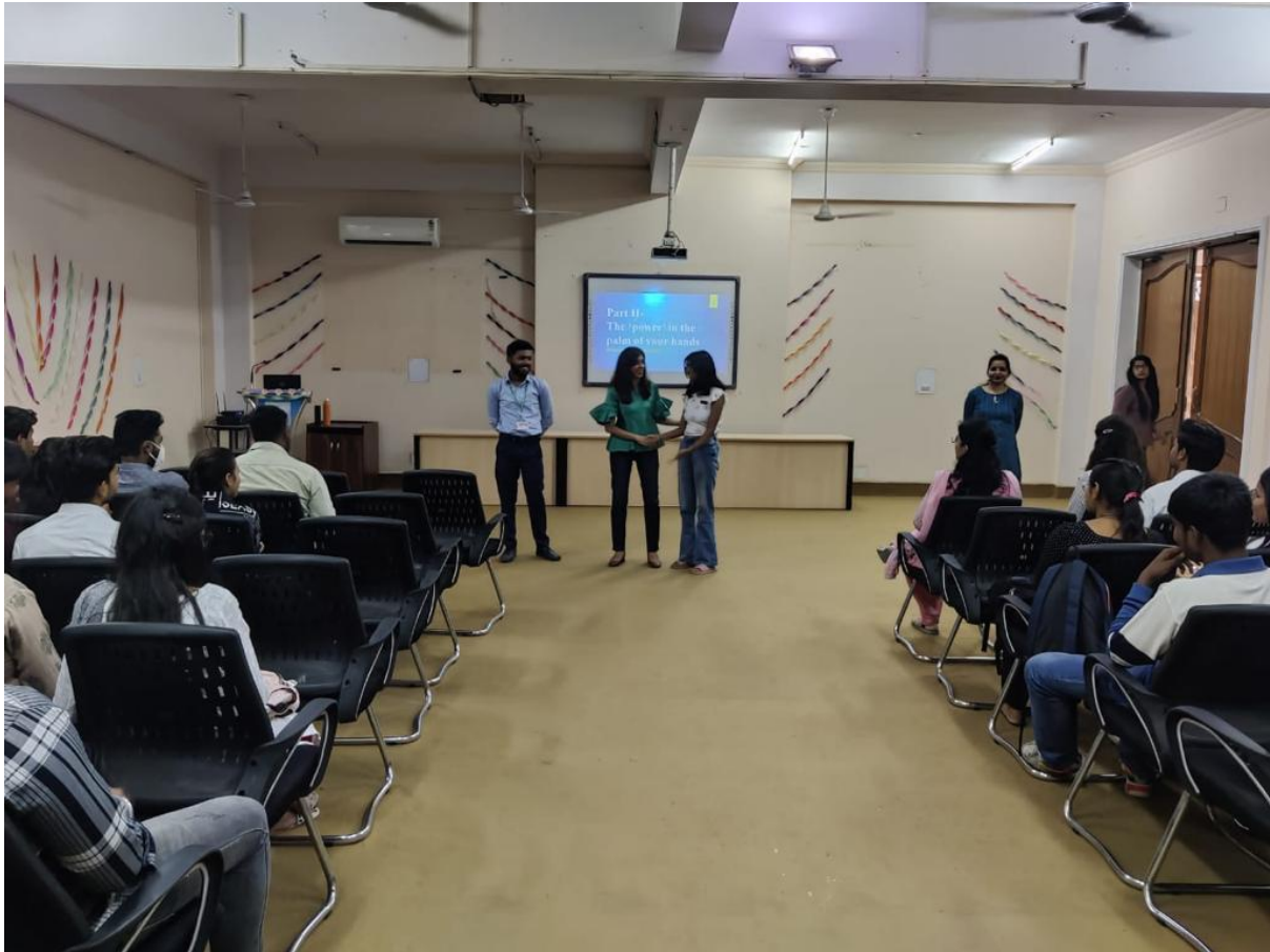
"The Hidden Language: Exploring the Profound Impact of Non-Verbal Communication on Presentation Mastery"