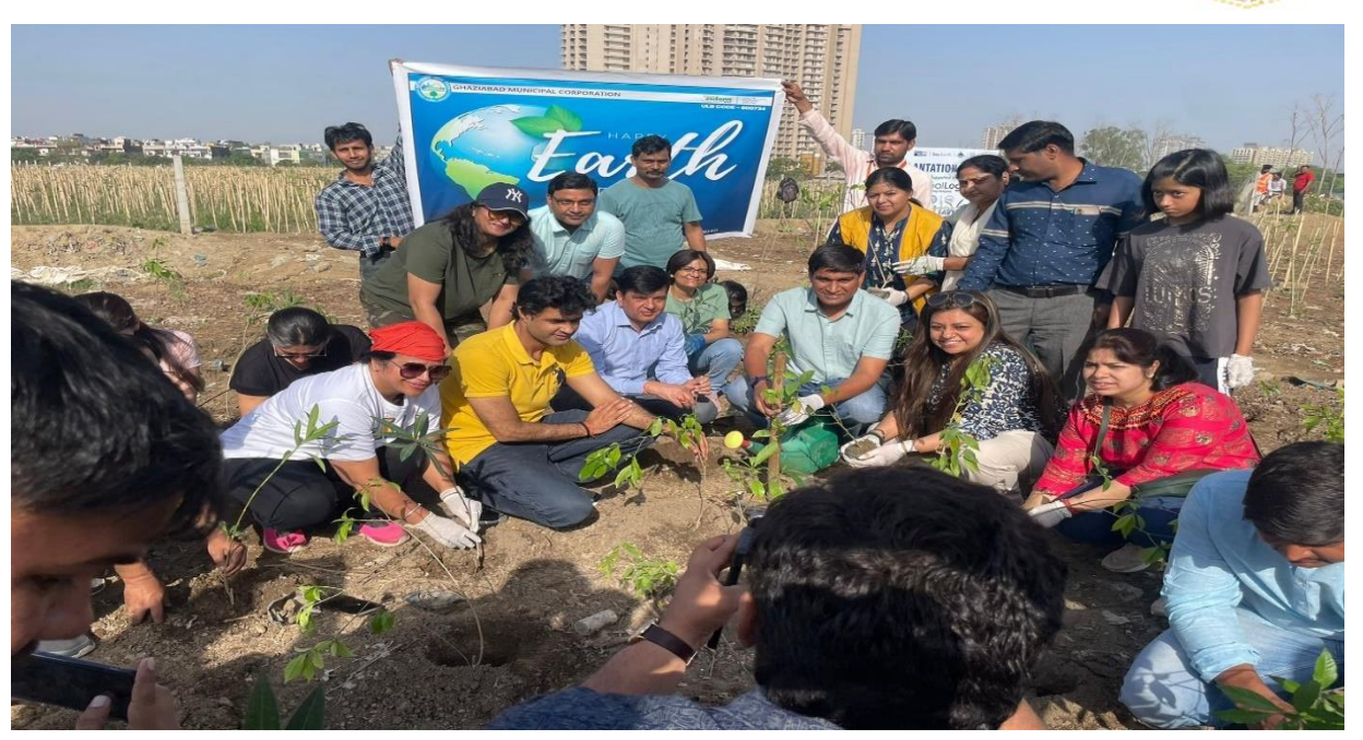
Volunteers doing plantation