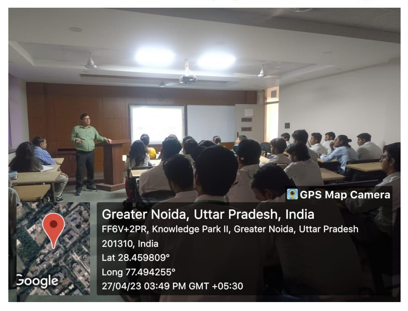
Fig 2:Dr. HimanshuRastogi (Resource Person ) express their thought about code of conduct.