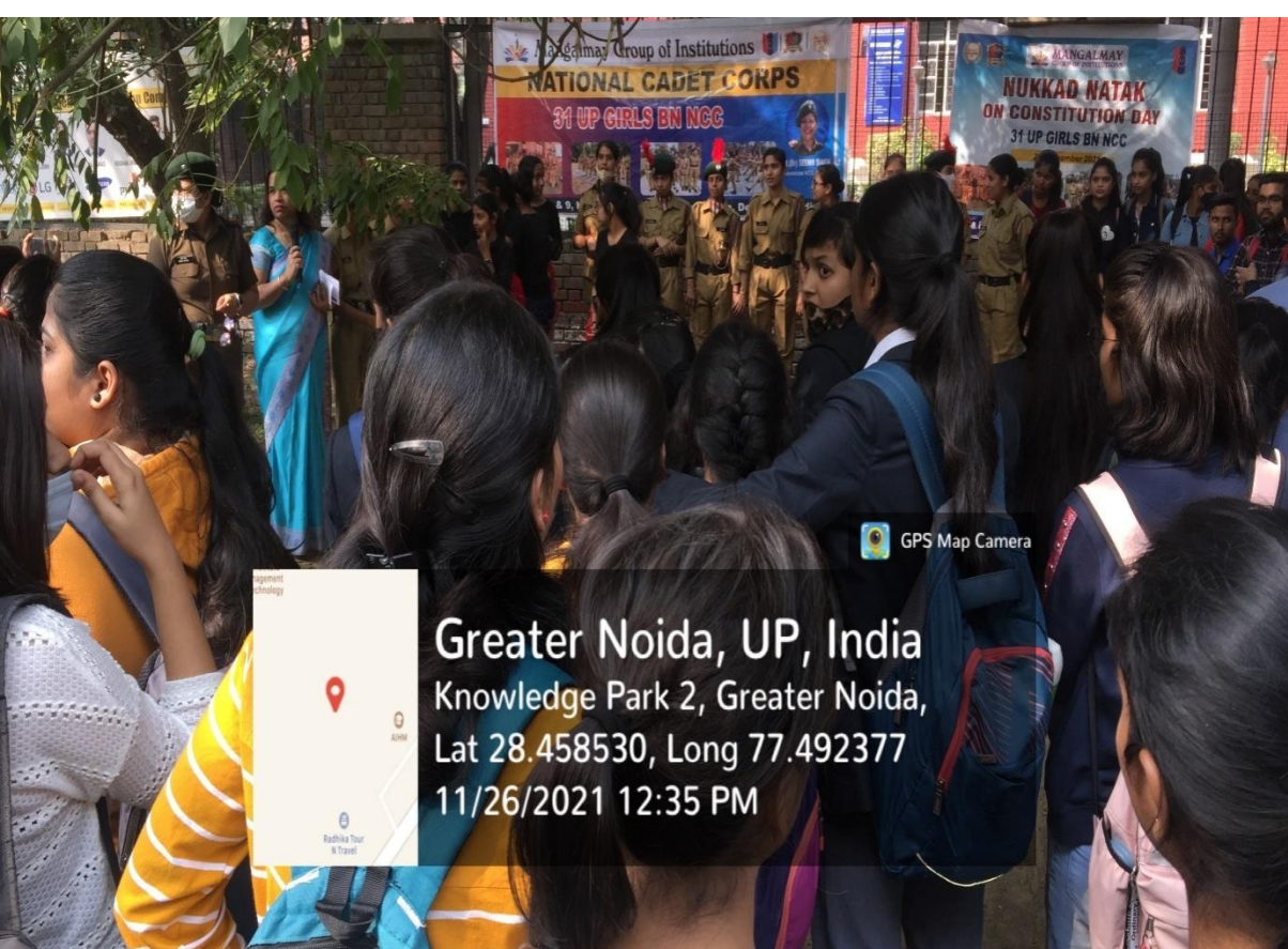
Nukkad Natak and beneficiaries