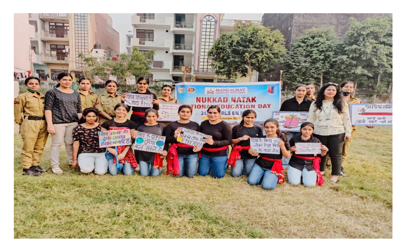
NCC Cadets ready for NUKKAD Natak