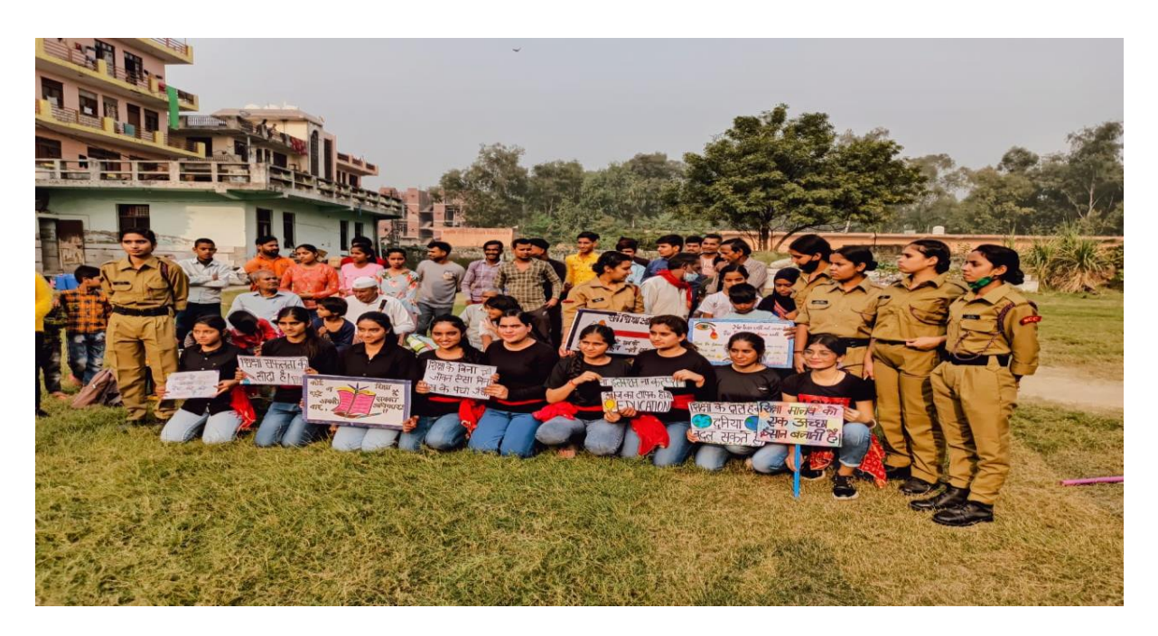
NCC Cadets with posters spread the message about the importance of education