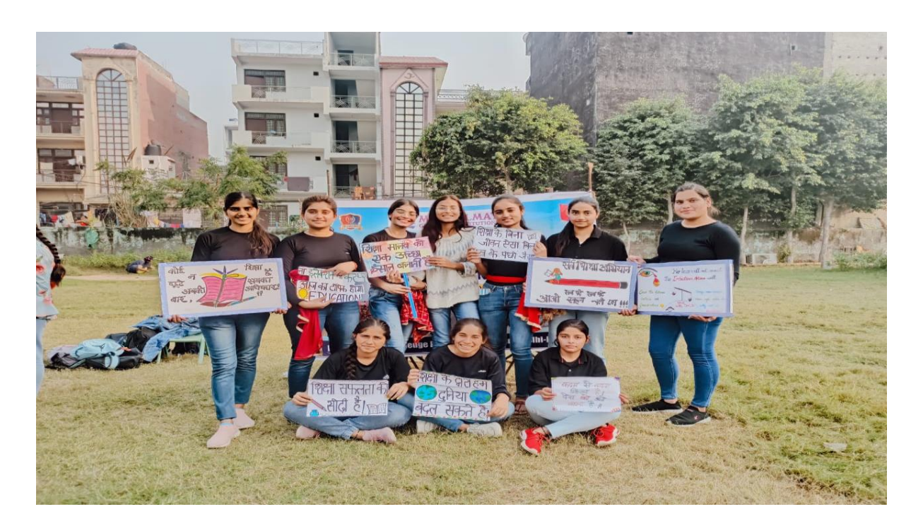
NCC Cadets with the posters and slogans