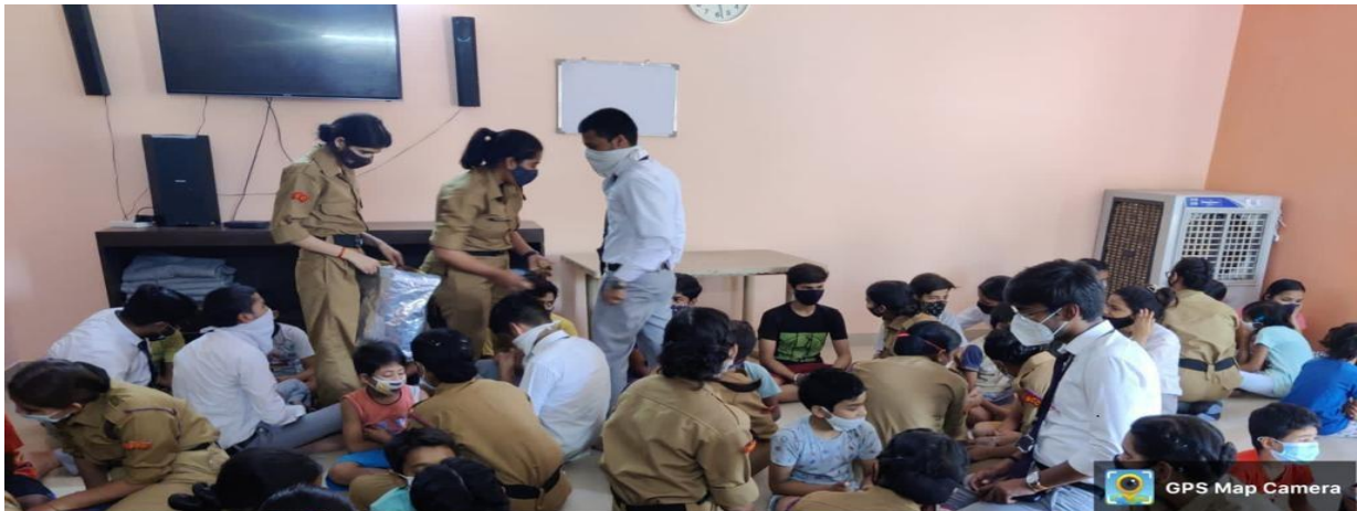
Cadets and students interacting with kids