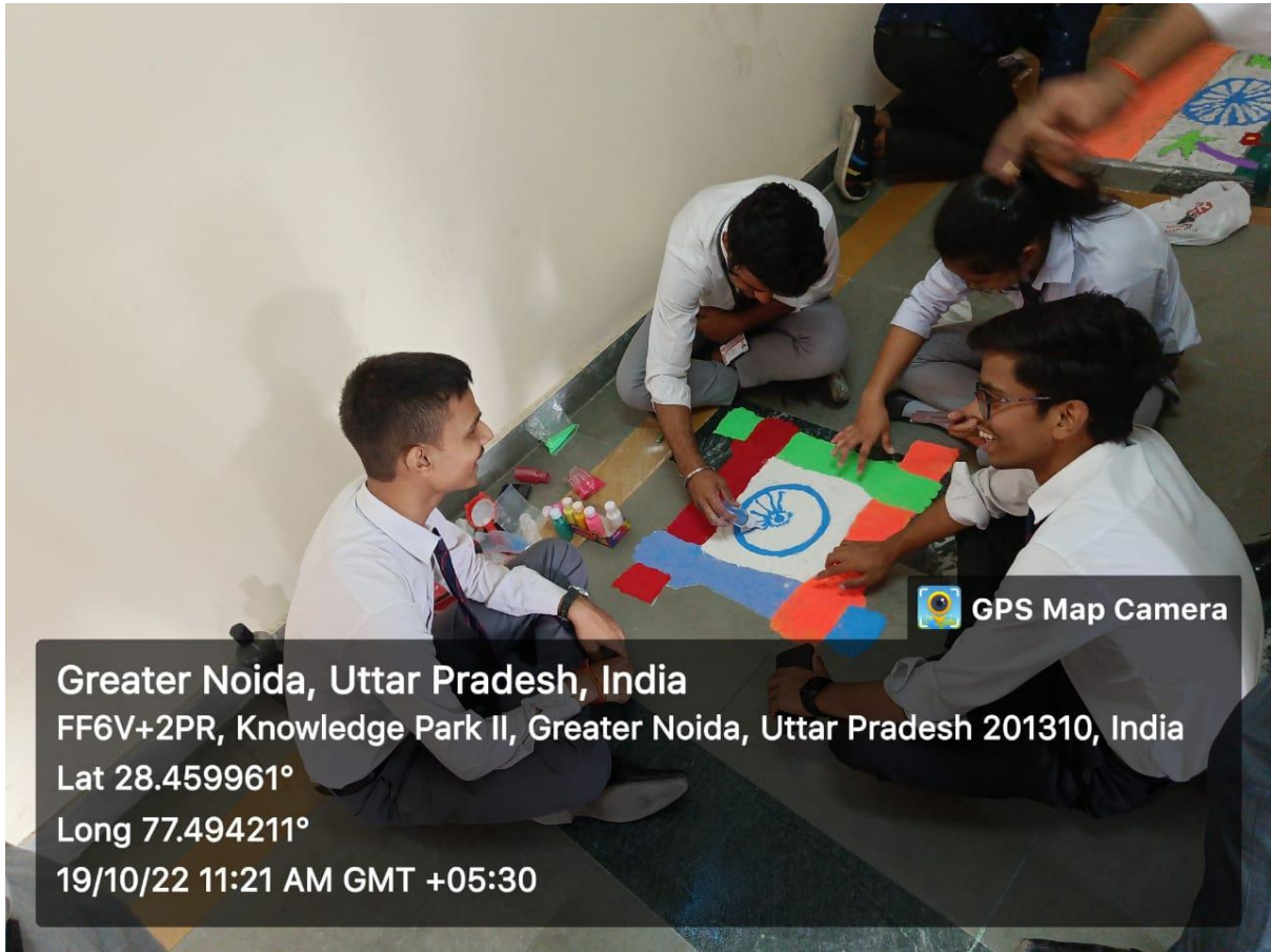
Figure 2 Students of BCA Third Sem during Rangoli Making Competition