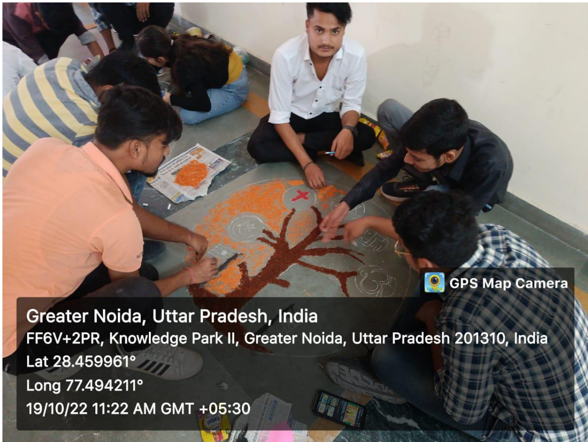
Figure 1 Students of BCA First Sem during Rangoli Making Competition