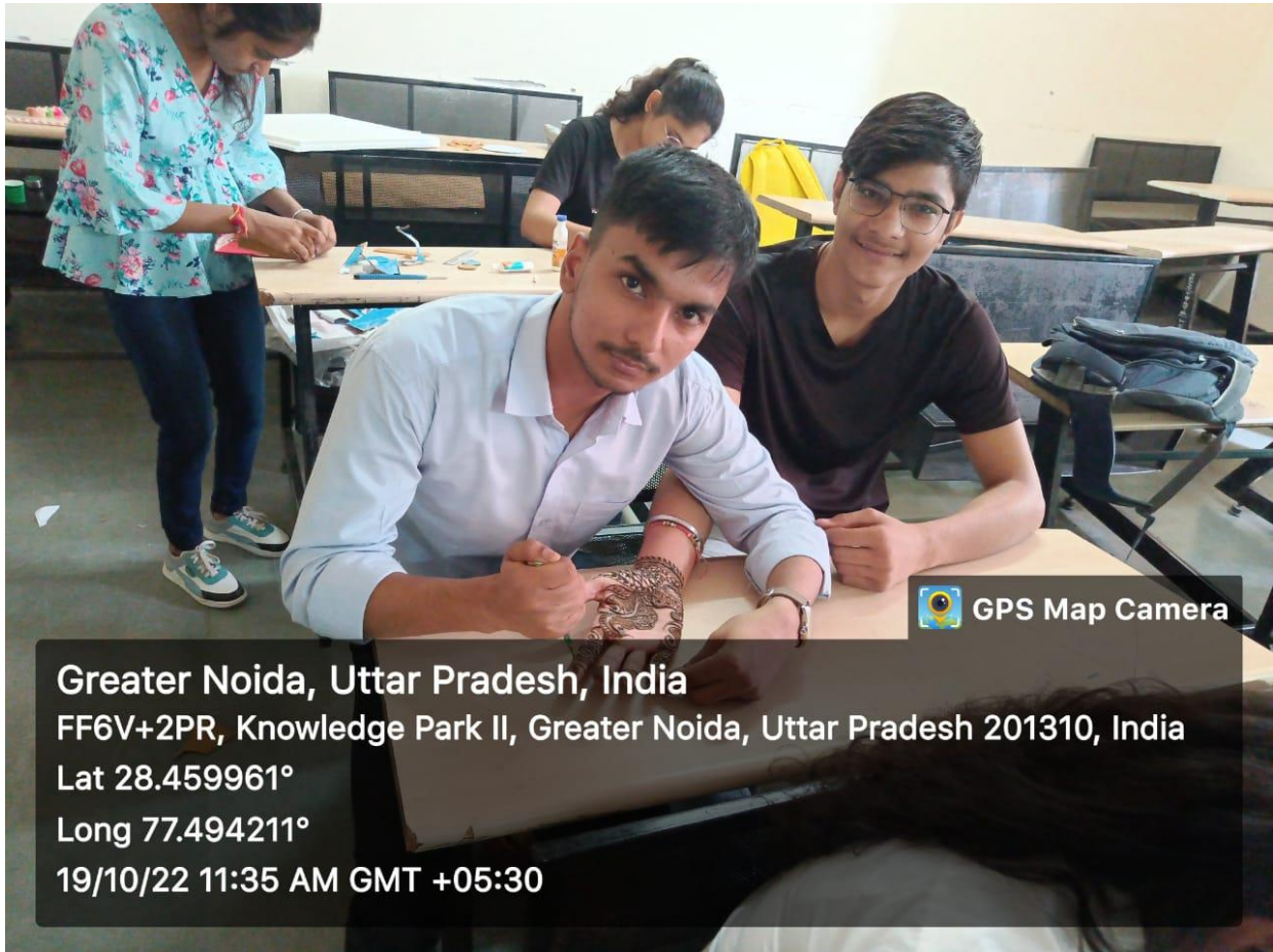
Figure 1 Student during Mehndi Competition